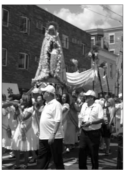
St. Ann's tradition: Come for the zeppole, sausages with peppers, and music. Stay for the procession on Sunday.

The world's best zeppole, plus music, arcade games and good fellowship with Hoboken natives and newcomers can be found each year at Hoboken's two great traditions, St. Ann's Feast in midsummer, and the Italian Festival in the first week of September.