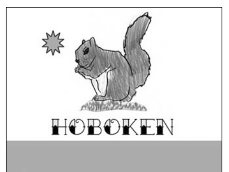
Kids capture Hoboken in a flag to celebrate national Flag Day, June 14. Charlie Smith's design is pictured above.

In conjunction with the "Up and Down the River" Family Fun Day, which occurred on Flag Day, the Hoboken Historical Museum sponsored a contest for local schoolchildren to