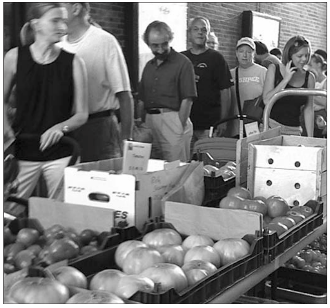
History you can sink your teeth into at the Museum's Annual Heirloom Tomato-Tasting Festival.

Favorites over the years have included the tart "Aunt Ruby's German Green," the supremely flavorful "Brandywine Pink,"