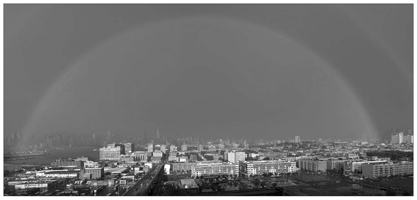
Awed by the panoramic view from his studio in the Yardley building, photographer Edward Fausty waited patiently for fleeting moments of spectacular beauty. Above, "Rainbows Over Hoboken, 2008."