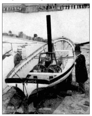
Photos of early steam engines like this reproduction of Stevens' Juliana are featured in the "Up and Down the River" exhibit.

The show will feature "on board" scenes showing life aboard the vessels, including visits to the pilot house and "down below" in the seldom-seen world of the engine room. Glimpses of some of the famous liners that have called upon our port and a special insight into the field of preserved steam